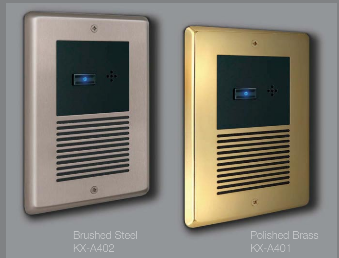
Brushed Steel KX-A402

A range of stylish metal faceplates are available: